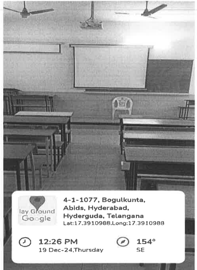
Class Room No: C-106